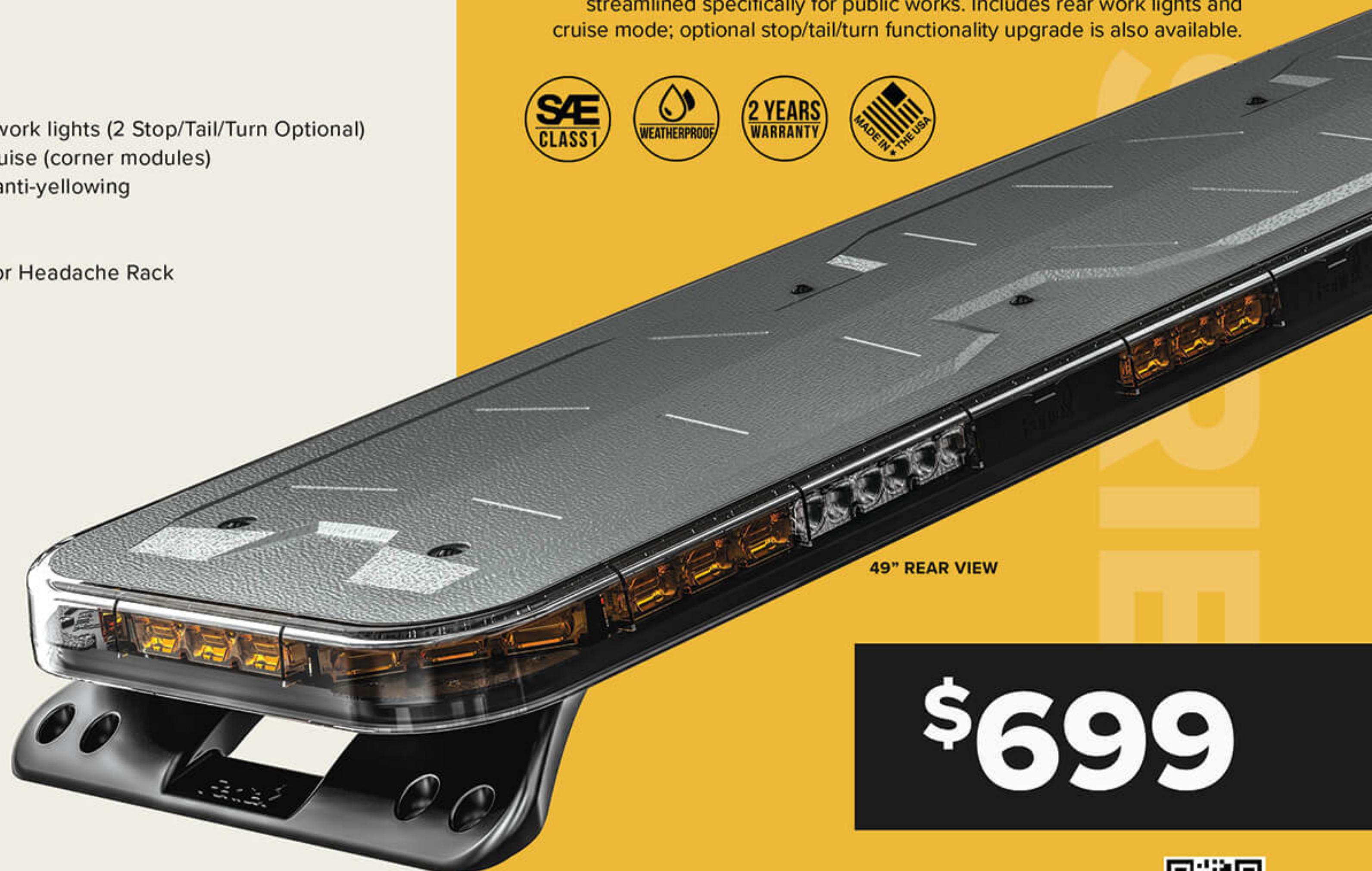
49\" REAR VIEW